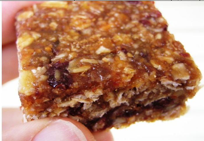
Image 5. Mendo Food Futures is developing guides for using wholesome, locally grown and potential storage foods in everyday meals and snacks. For example, make your own energy bars with minimally processed grains, toasted nuts, dried fruit and honey. No baking or refrigeration required, and almost universally loved.