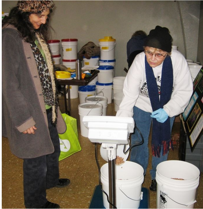
Image 4. People redeem Mendo Credits for food in downtown Willits, such as the Community Center pictured here. As our stores become depleted we can decide to issue a new batch of currency. Profits from previous sales plus income from the new Mendo Credits can form the capital to buy more food and replenish our stocks. We encourage household storage and consumption so that the population has their own food buffer and we can expand our capacities.

towards essential long-term capital. For example, if a small grain silo costs $5000 to build, credits can be issued with prices that reflect both the cost of grain and storage. Eventually, local farmers could be contracted to supply grains and dry beans to our silos. Our land base would then have higher value and be able to support more jobs.